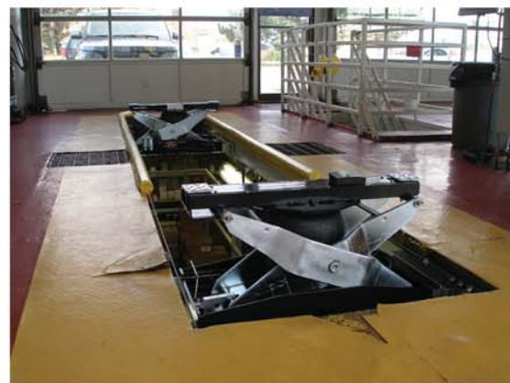
Two Rolling Pit Jacks lift the entire vehicle

Stan Jacks feature; 6/7/9,000 lb. and higher capacities multi-level safety locks, Air Bag Scissor or H.D hydraulics, easy rolling wheels, convenient pull handle and adapter storage right on the jack precision crafted components with zinc plating and powder coat paint