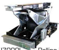
J7000L Rolling Pit Jacks shown with universal inline wheel assembly