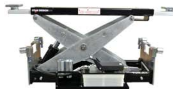
J6000HFL shown with universal tire guard assembly