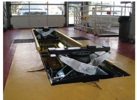
Two Rolling Pit Jacks lift the entire vehicle

Stan Jacks feature; 6/7/9,000 lb. and higher capacities multi-level safety locks, Air Bag Scissor or H.D hydraulics, easy rolling wheels, convenient pull handle and adapter storage right on the jack precision crafted components with zinc plating and powder coat paint