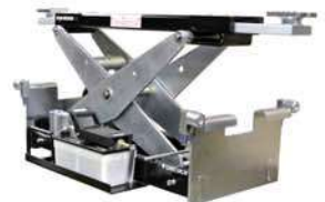
J6000HFL shown with universal tire guard assembly