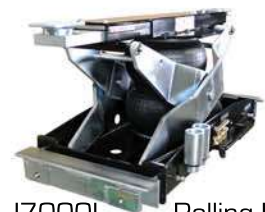
J7000L Rolling Pit Jacks shown with universal inline wheel assembly