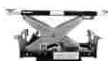
J6000HFL shown with universal tire guard assembly