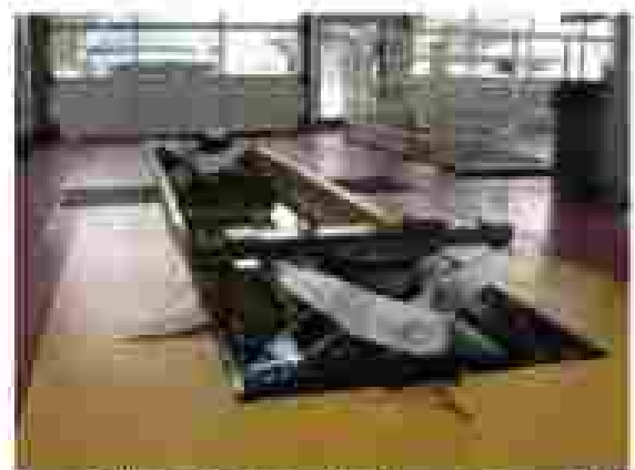
Two Rolling Pit Jacks lift the entire vehicle

Stan Jacks feature: 6/7/9,000 lb. and higher capacities, multi-level safety locks, Air Bag Scissor or H.D hydraulics, easy rolling wheels, convenient pull handle and adapter storage right on the jack, precision crafted components with zinc plating and powder coat paint.