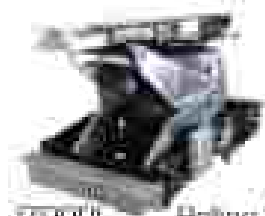
J7000L Rolling Pit Jacks shown with universal inline wheel assembly