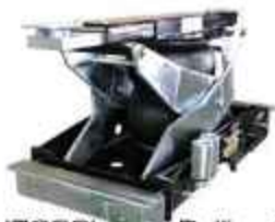
J7000L Rolling Pit Jacks shown with universal inline wheel assembly