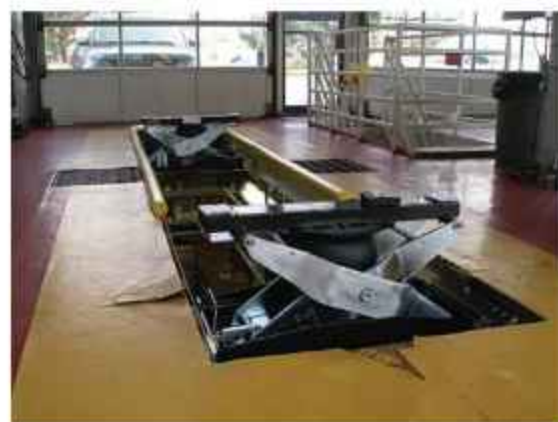
Two Rolling Pit Jacks lift the entire vehicle

Stan Jacks feature; 6/7/9,000 lb. and higher capacities multi-level safety locks, Air Bag Scissor or H.D hydraulics, easy rolling wheels, convenient pull handle and adapter storage right on the jack precision crafted components with zinc plating and powder coat paint