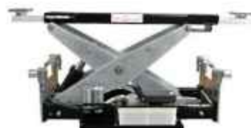
J6000HFL shown with universal tire guard assembly